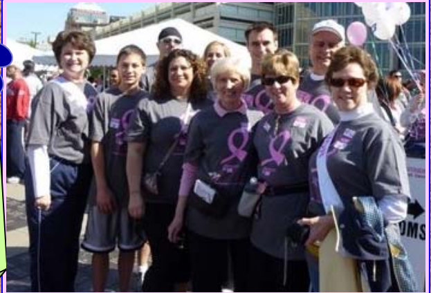
Team NorthCoast at Making Strides for Breast Cancer, May 15, 2010

Ohio Council for Home Care: Annual Conference. Columbus, OH (September 15-16, 2010)